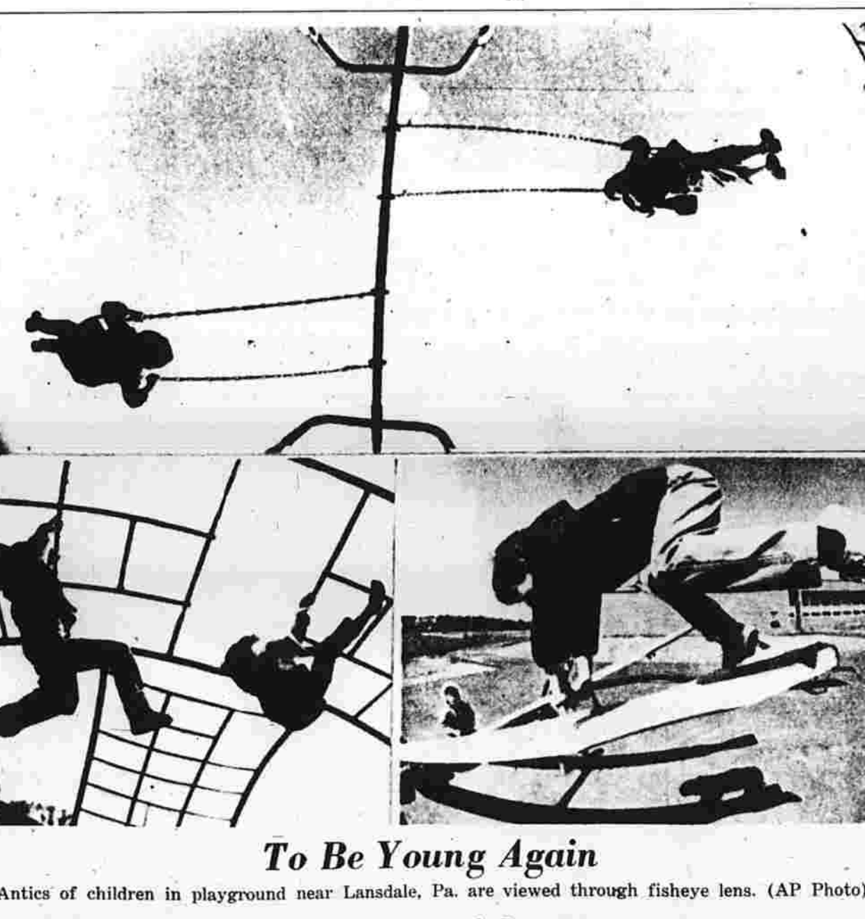
Antics of children in playground near Lansdale, Pa. are viewed through fisheye lens.

KINGSTON, Ont. (AP) — Canada's largest prison was in a state of siege today as 500 rampaging prisoners took control of the main cell block at the Kingston penitentiary.